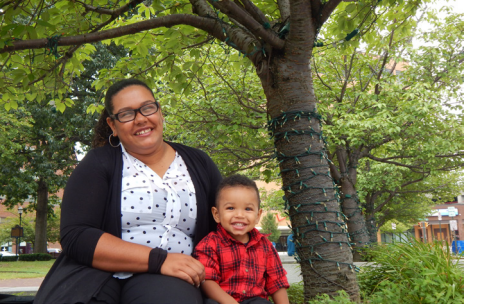
All pictures feature Pennsylvanians who have become self-sufficient with help from Community Action. Their stories can be found at www.thecaap.org.